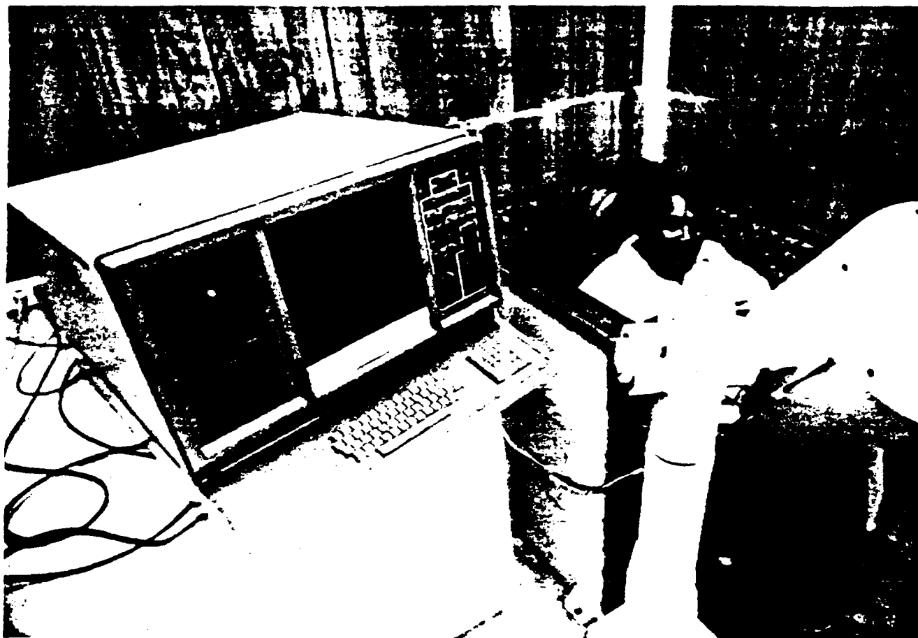
Whole-Body Counting in One of the New Chair Geometry Systems. Two Independent Systems are Used Throughout a Field Study