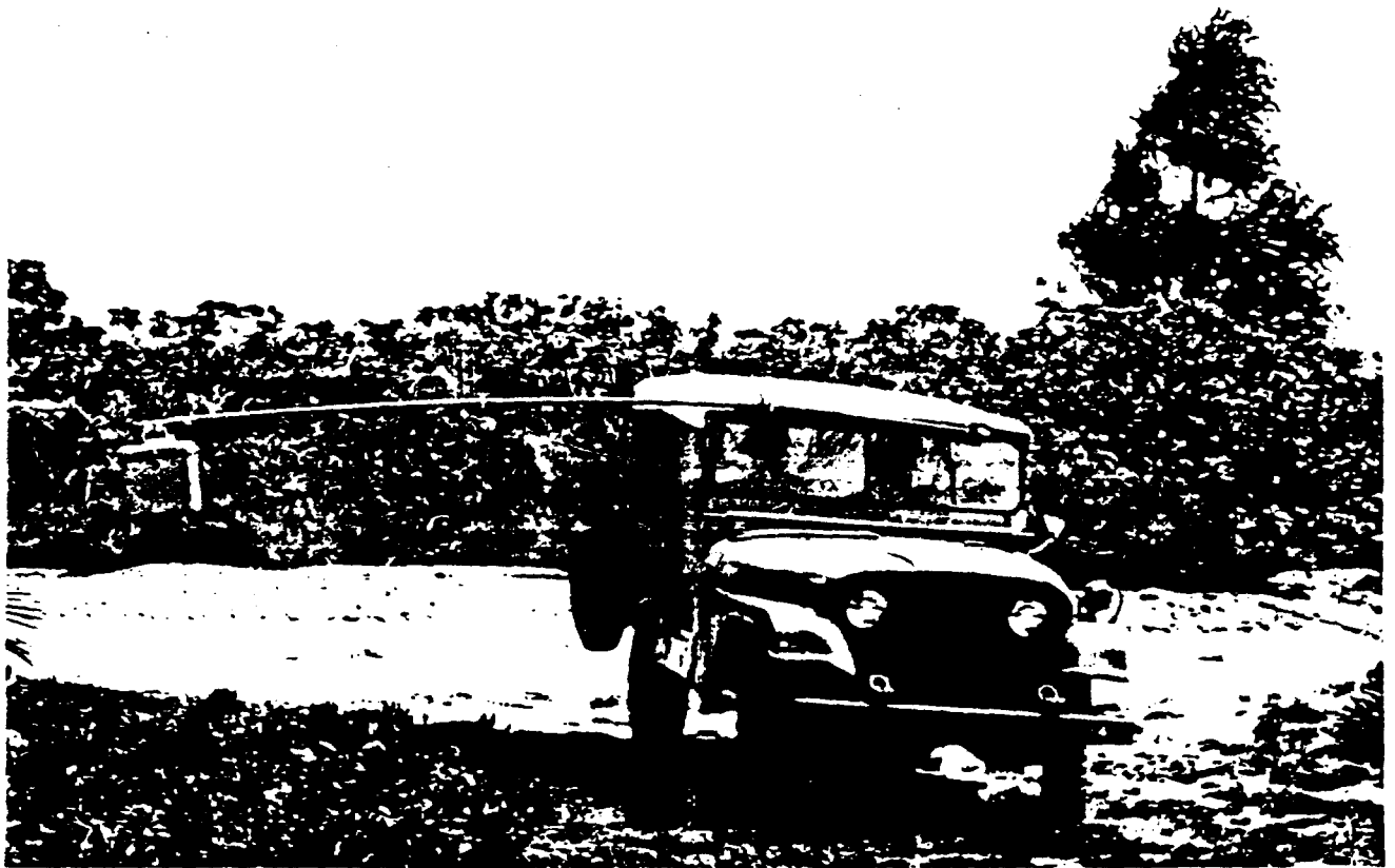
External Radiation Measurements at Bikini Atoll