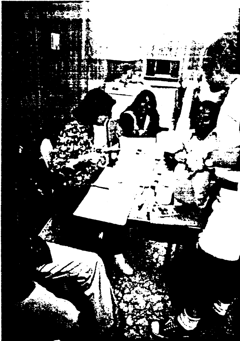
Collection of Demographic, Anthropometric and Physiologic Data and Selection of Individuals for the Bioassay Programs