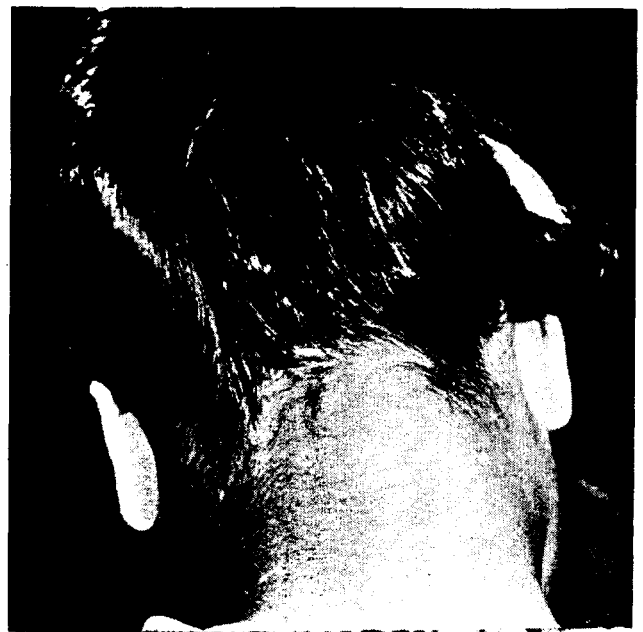
Fig. 2.—Photograph in same patient as figure 1 two years after exposure showing complete healing of lesion.

The following changes were noted in the two-year postexposure biopsy sections: 1. No neoplastic lesions were present. 2. No epidermal cellular alterations suggestive of a precancerous lesion were seen. 3. In some sections, acanthosis, absence of pigment in the basal layer, and atrophy and benign dyskeratosis were noted occasionally in the stratum spinosum of the epidermis. 4. The papillary layer of the dermis frequently showed distinct degenerative alterations in the collagen, characterized usually by homogenization of the collagen and what appeared to be an alteration in the distribution of mucopolysaccharide when compared with control sections. Occasionally mucin was seen in areas of degeneration in the dermis. 5. Capillary dilatation was noted in the dermis and, in one patient, in the hypodermis. Medial degeneration in an artery was noted in one patient. 6. The biopsy specimen from a single patient showed increase in heavy dense bands