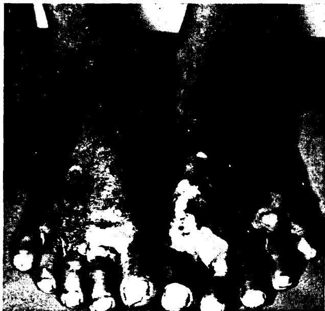
Fig. 3.—Photograph showing beta-radiation lesions of the feet in 12-year-old boy four weeks after exposure. There is a weeping ulceration between first and second toes of right foot. Note desquamation of both feet.

The mean absolute lymphocyte level was slightly increased over the one-year level. The mean level was still, however, somewhat below the mean control level (75-80%) in both age groups in the Rongelap and Ailingnae people (fig. 5). In the exposed groups, six people had lymphocyte counts of 1,500 or below