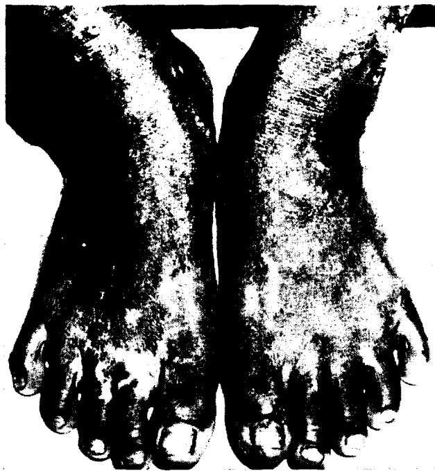
Fig. 4.—Photograph in same patient as in figure 3 two years after exposure showing that further repigmentation has occurred. There is atrophy and scarring of skin with some adherence to subcutaneous tissues at site of deepest lesion, between first and second toes of right foot.

The mean eosinophil levels showed an increase over the one-year level in both groups and were slightly above the mean level of the Majuro controls, but, in the Rongelap group, they were slightly below the two-year levels in the Rita controls. A considerable number of individuals in both the exposed and control groups showed eosinophilia. Since it was thought that parasitic infestation might have been responsible, stool examinations on 10 Rongelap people with high