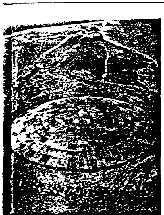
(left) People walking on the concrete dome covering an atomic bomb crater on Rongelap Island, Enewetak atoll. (below) Nuclear clean up on Rongelap Island. (left) U.S. Army personnel in full protective gear. (right) Army personnel mixing plutonium-contaminated soil with cement to form the massive concrete dome.