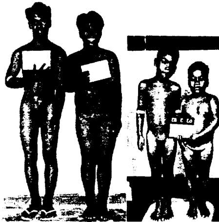
Fig. 4. Right: Subject No. 3 and his younger brother (No. 83) in 1963. Left: Same boys in 1973 after No. 3 had been given thyroid hormone for 8 years.