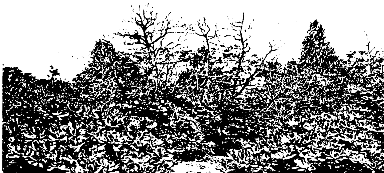
Figure A-2. Affected Guettarda speciosa with normal appearing Scaevola sericea .

normal green color. Ground surveys revealed that Scaevola sericea was common and normal in appearance. Many of the Guettarda speciosa appeared to be in poor condition (Figure A-2). In some, all or nearly all the leaves were gone from the terminal 1 to 12 in. of the branches, and other leaves were yellowed and shriveled. In other Guettarda , nearly all the leaves were gone, and the bushes appeared completely dead. More than 50% of the Guettarda were affected in whole or part. In one area of Naen several hundred yards inland from the ocean beach, there was a field of \approx 30 Guettarda , all of which were dead. Some young Pisonia grandis were seen which appeared to be in good condition. Mature Pisonia were seen which were partially defoliated, but these did not appear to be greatly different from those seen on Rongelap Islet on the southeast corner of Rongelap Atoll. None of the mistletoe-like clumps described by Fosberg were observed. Several Ochrosia oppositifolia were seen with nearly complete defoliation, which appeared dead. A small grove of coconut trees near the center of Naen Islet contained 4 to 5 dead trees within a radius of \approx 300 yards, which were decapitated at heights 5 to 12 ft above the ground with no evidence of axe or machete marks. Two 2-headed coconut trees were seen, one with fronds that were mostly brown and appeared dead growing from the trunk \approx 2 ft below the true crown of