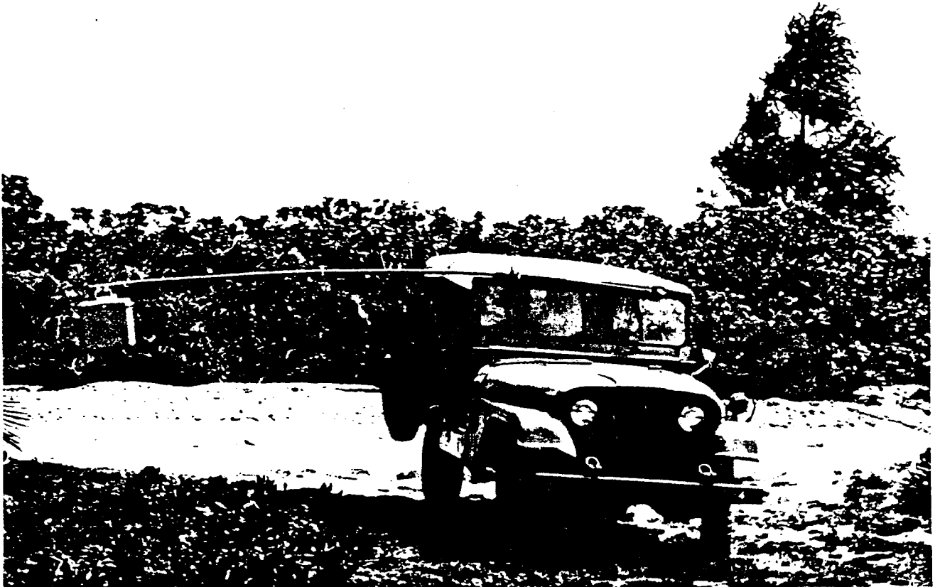
External Radiation Measurements at Bikini Atoll