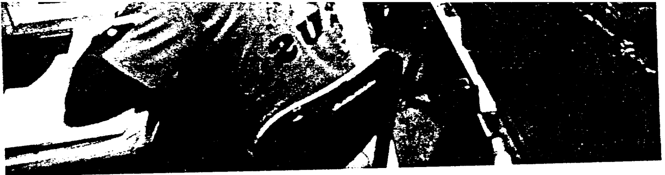
Bed Geometry Whole-Body Counting at Bikini Atoll