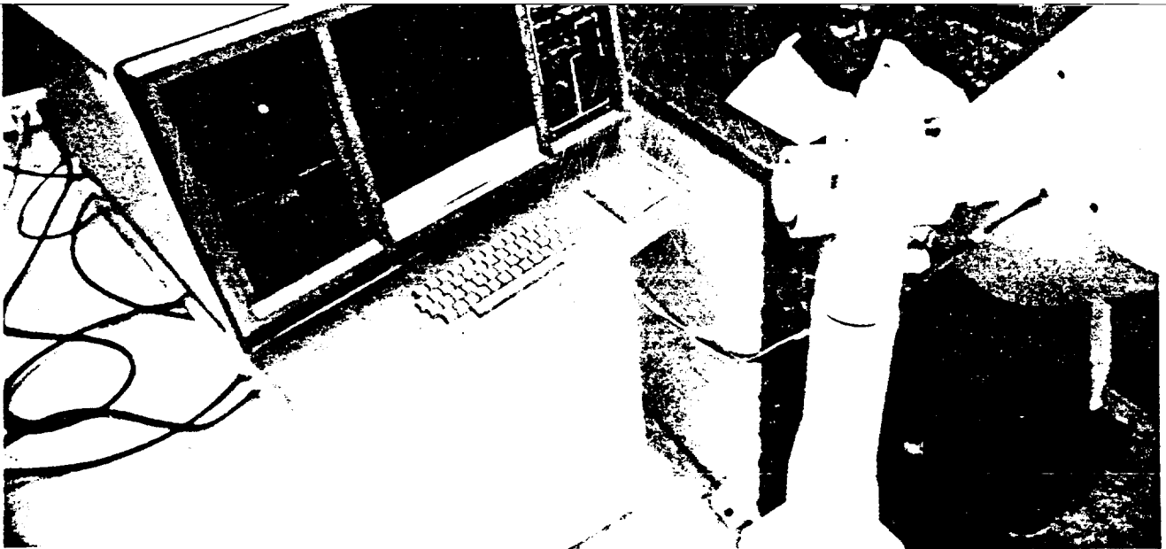
Whole-Body Counting in One of the New Chair Geometry Systems. Two Independent Systems are Used Throughout a Field Study